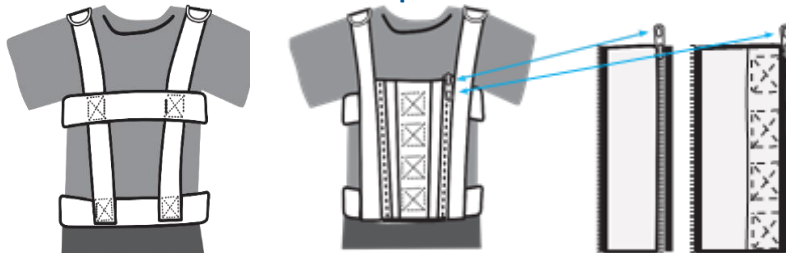
VEST (front view) VEST (back view)